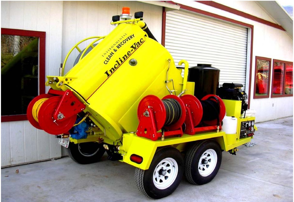
Typical Incline-Vac Hose Reel - picture shows 200' of 2" dia hose or The hose reel holds 100' of 3" dia. vacuum hose