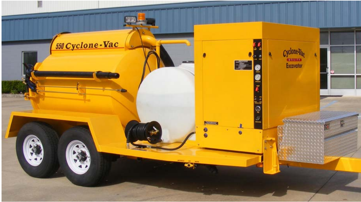
Model 550 Cyclone-Vac