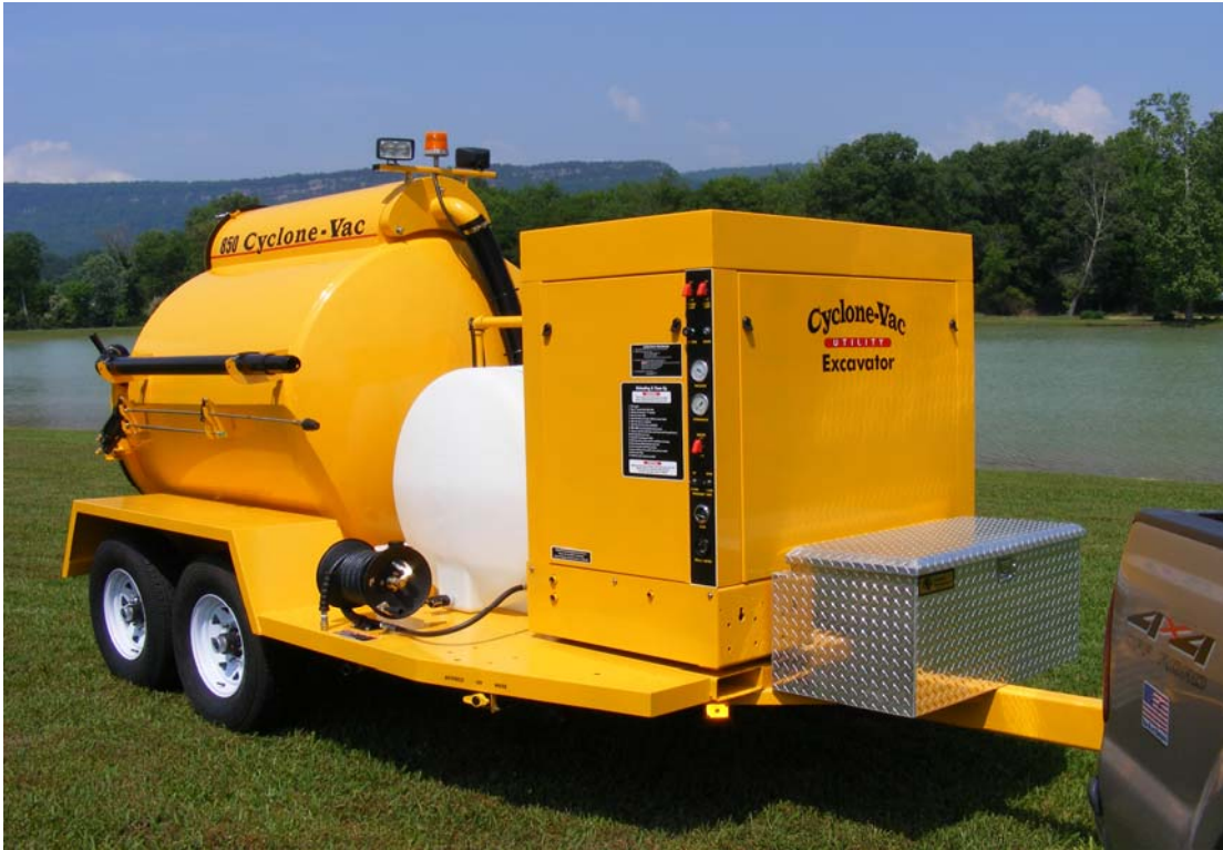
Model 850 Cyclone-Vac